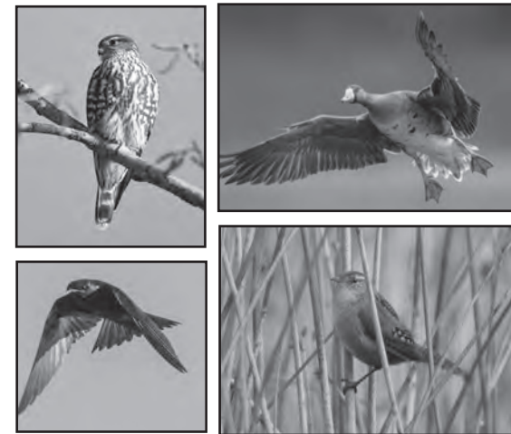
clockwise from upper left: Merlin, Greater White-fronted Goose, Marsh Wren, Purple Martin.

Consult the Admiralty Audubon Society Checklist of Birds for species, abundance, and season of occurrence. The AAS checklist and pdfs of this brochure are available on the AAS website ( http://admiraltyaudubon.org ).