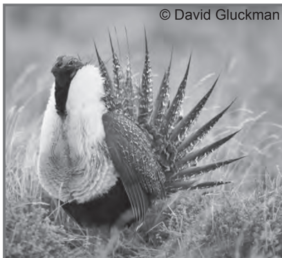
Image below: Male Greater Sage Grouse dancing on the Malheur Lek. A lek is ‘a patch of ground used for communal display in the breeding season by the males of certain species’. Image right: Western Grebe with chicks and a small fish aboard in Malheur NWR.