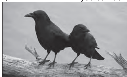
Crows at Kah Tai