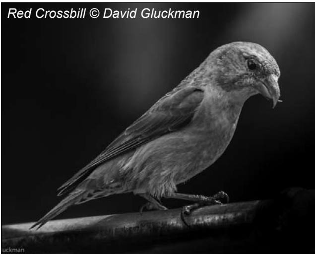
Red Crossbill