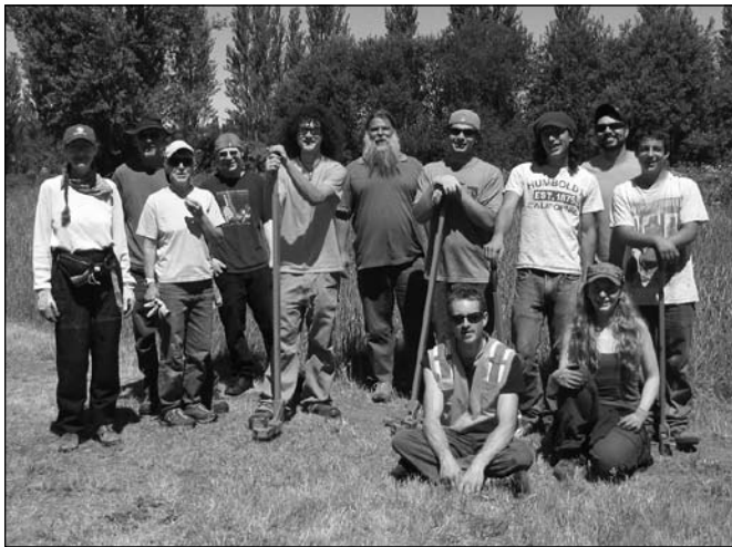
Labor Leaders join the usual crowd of volunteers at Kah Tai.